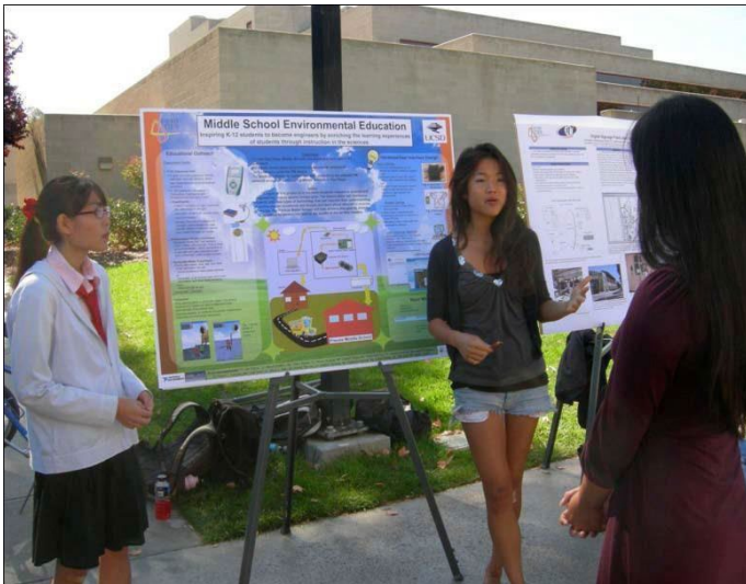
TIES Project - Middle School Environmental Education

The benefits for student's involvement in TIES are numerous, and include improved communication, organizational, and leadership skills, start-to-finish design experience, multidisciplinary teamwork, experience in project and resource management, ethics training and responsibility, as well as customer and community awareness. Finally, TIES provides demonstrable and measurable outcomes of undergraduate engineering theoretical knowledge, technical skills, teamwork, communication, ethical responsibility and value for professional development. MAE students are eligible to receive 4 units of technical elective.